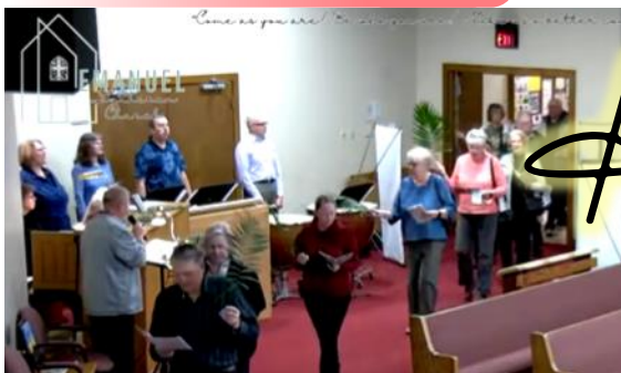
"All Glory, Laud and Honor" fills the worship center during the Procession on Palm Sunday.