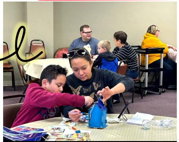
Families work on making birdhouses at the craft workshop. They also made Easter snow globes and decorated their own sugar cookies.