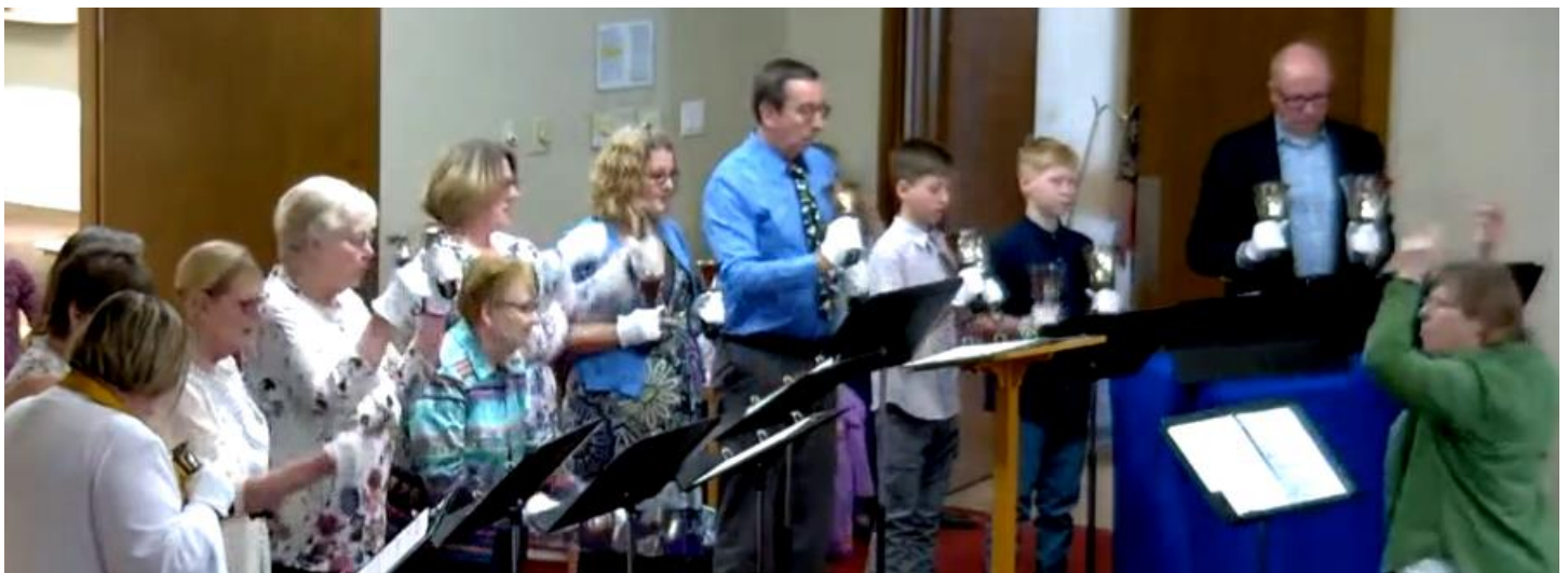
The Emanuel Bell Choir played "The Strife Is Over" at the 9:30 am service on Easter.