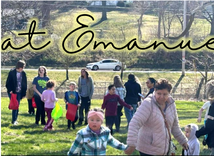
We had a beautiful day for an outdoor Easter Egg hunt!