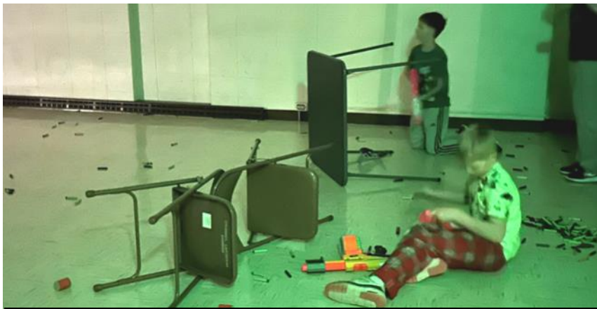
Our annual Maundy Thursday lock-in would not be complete without a Nerf war.