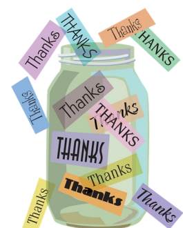
Overflowing With Thanks

One of the activities at Hanging of the Greens was packing "final's week care packages" for Emanuel's college students full of goodies. We received several "thank you's" through Facebook, email and cards that we would like to share.