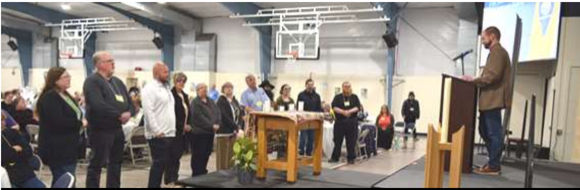
The installation of Synod Council was one of the last pieces of business at the assembly.