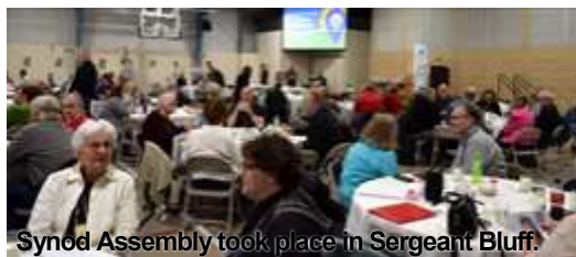
Synod Assembly took place in Sergeant Bluff.