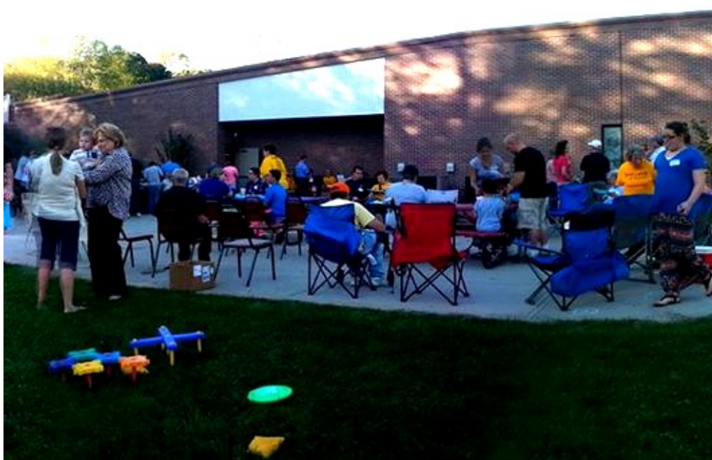
Enjoying good food and good company on October 11th at the Annual Fire Pit Night.

Vision Statement: To Grow in Faith, Love, and Spirit