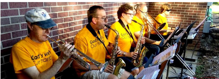
DaBand entertains members, friends and neighbors at the Annual Fire Pit Night.