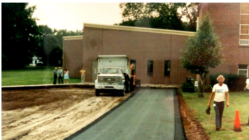
Paving the parking lot after the addition is completed.