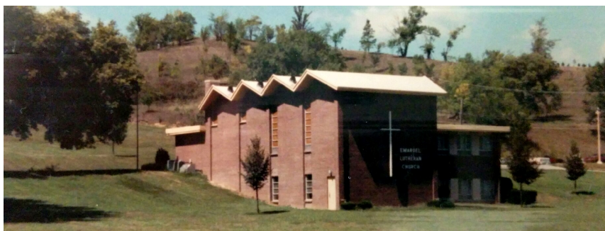
2444 N. Broadway before the addition, doubling the size of the building.

Thank you for helping with this project. Because of your caring and generosity 25 families will be able to have a Thanksgiving dinner.