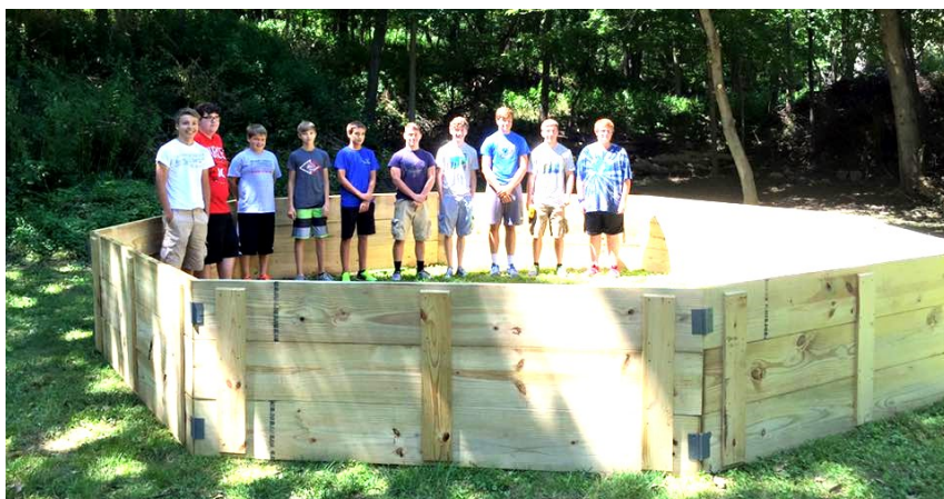
Troop 249 in the Gaga Pit they built in the dug-out area behind the church.