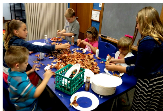
Students make "leaf wreaths" for our neighbors at Midlands Living Center.