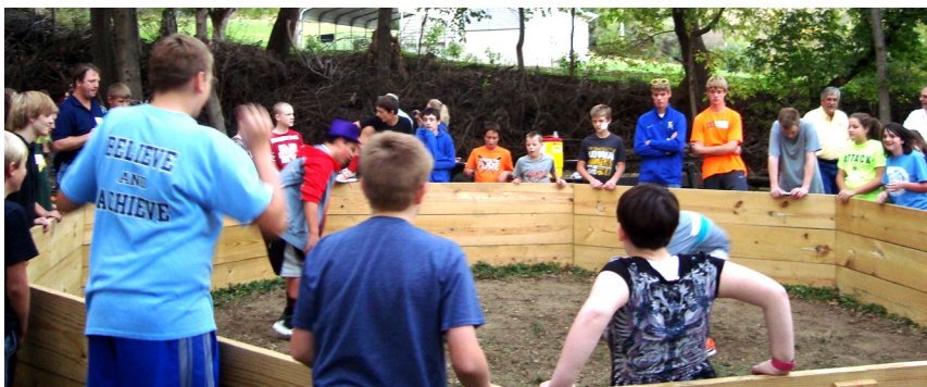
ConFest Attendees gather in the Gaga pit for some fun before heading to the breakout sessions at Emanuel Lutheran Church.