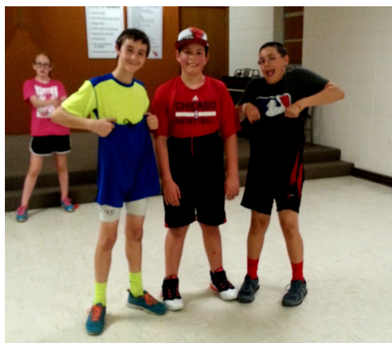
Being goofy at the 2015 spring lock-in.

If you would like to contribute to this project, suggested items would be microwave popcorn, peanut butter, crackers, trail mix, stamps, envelopes, hard candy, gift cards, etc. along with cards of encouragement.