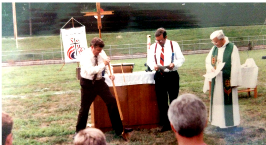
Groundbreaking ceremonies for the addition to the church building.

Although the organization of the church began in 1890, services were held several places in the city before the property at 7th & Mill Street was purchased in 1891. Services were held in the basement until the building was completed in 1898. The property where Emanuel now sits was purchased in 1959. Sunday school and church services were held in a home located on the property until it had to be removed to for the new church building. It was dedicated in 1962. In 1989 work began to expand the size of the building due to the growing congregation. The addition was completed in time for the Centennial in 1990.