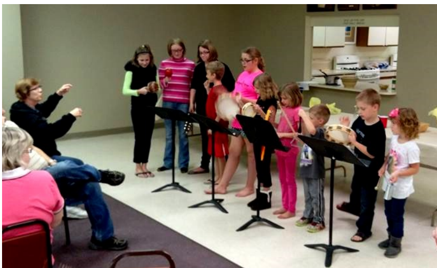
Students share their musical gifts at a service on Wednesday night.