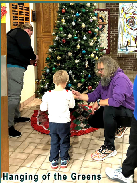
Hanging of the Greens