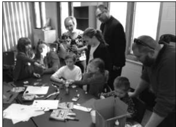
Students working on remembrance boxes while learning about communion.