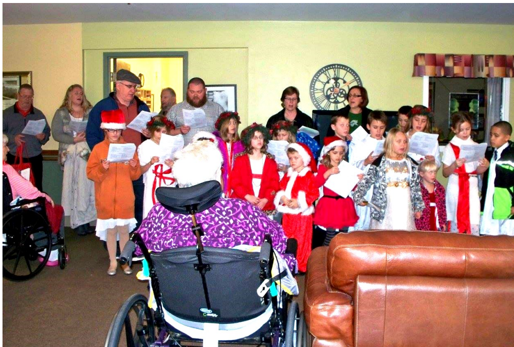
Caroling at Midlands Living Center on December 13 th

Vision Statement: To Grow in Faith, Love, and Spirit