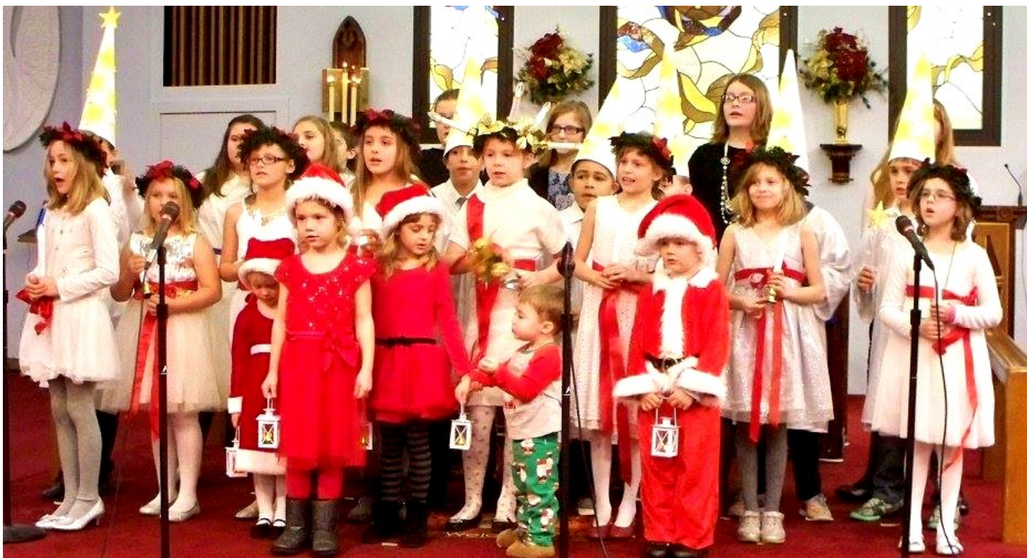
There were 28 participants in this year's children's program as well as confirmation students and others who helped with worship!