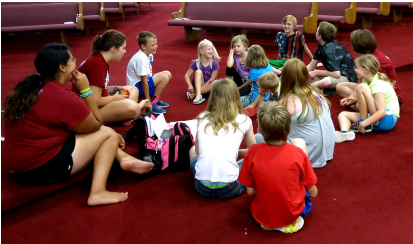
Lakeside staff , helpers and campers gather in the sanctuary during the 2015 day camp.