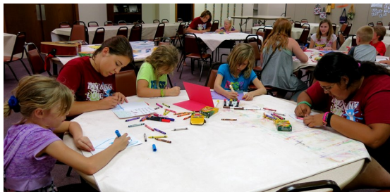
Lakeside staff , helpers and campers make greeting cards during the 2015 day camp.

Thinking about a summer camp for your kids? Don't forget the Emanuel Lutheran Church Day Camp here at church on August 1 through 4 from 9 a.m. to 3 p.m. each day. Day Camp will be led by trained bible camp staff from Lutheran Lakeside Bible Camp. The camp is open to children kindergarten through fifth grade. And we will need both youth and adults to serve as camp helpers and assistants. Cost for the week will be less than $40 per camper. And camp scholarships will be available, especially for families with multiple children at camp. You can't get a better deal than this!